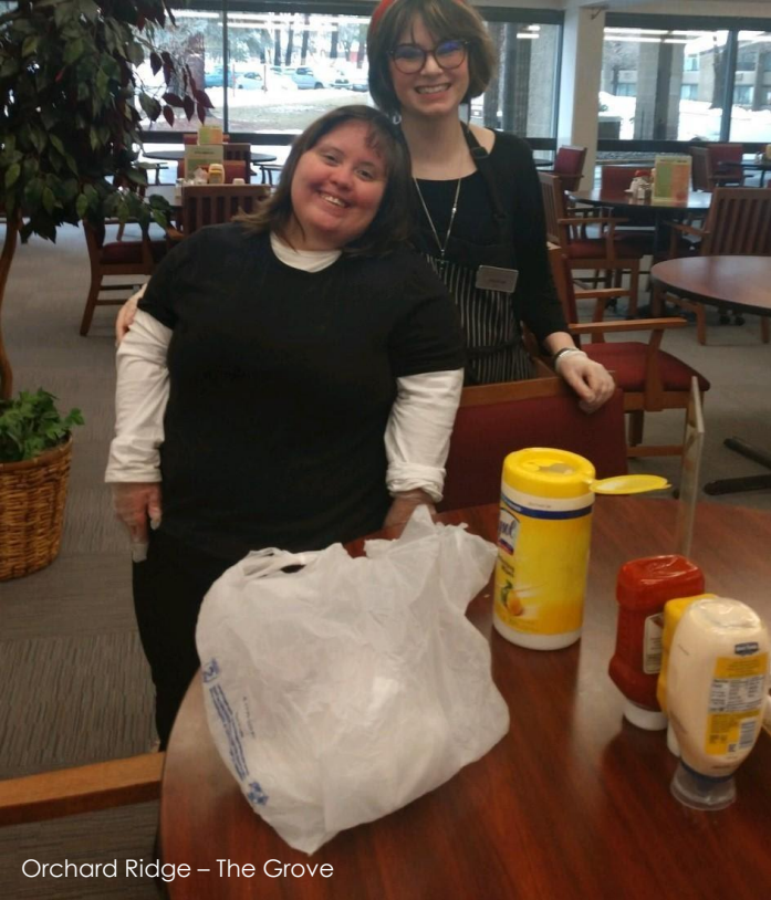
Orchard Ridge – The Grove