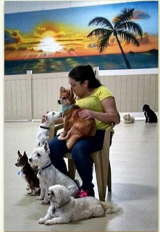
Coeur d'Alene Pet Resort & Doggie Daycare