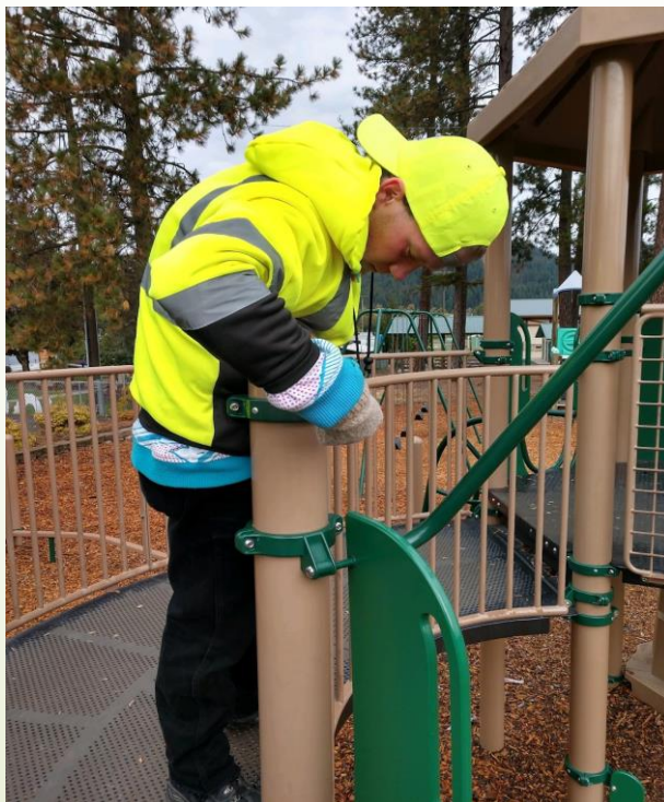
City of St. Maries

CSS staff will be on-site to provide you Vocational Support Services and help you understand your current work readiness.