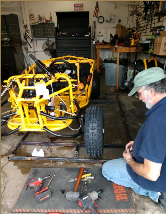
Odyssey Sports NW