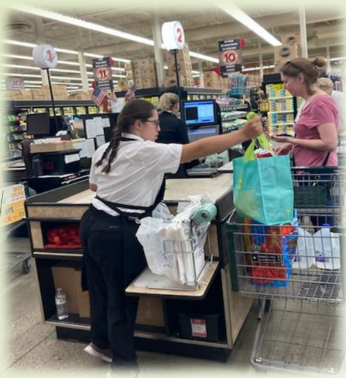
Courtesy clerk at Super 1 in Athol