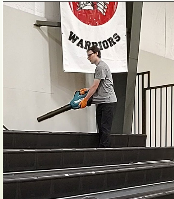
Custodial at Real Life Ministries Courts in Post Falls