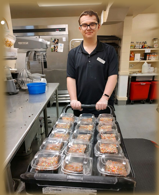
Food prep at the Grove, Orchard Ridge